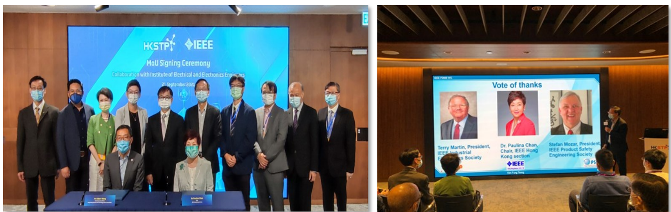
Figure 1. HKSTP and IEEE MoU Signing Ceremony

To address these challenges, the IEEE P2668 IoT Maturity Index (IDex) was proposed to regulate IoT smart sensors, process flows and applications. On 21 September 2021, a memorandum of understanding (MoU) on “IEEE P2668 IDex” was signed between Hong Kong Science and Technology Park (HKSTP) and the Institute of Electrical and Electronics Engineers (IEEE) Hong Kong Section at HKSTP 17W building Hong Kong.