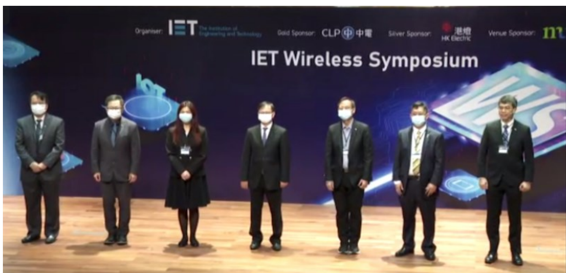
Figure 1. IET Wireless Symposium in 2021